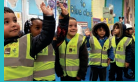
Road safety awareness