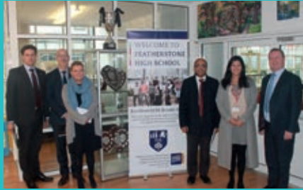
Schools career lab