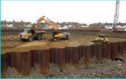
Site development update